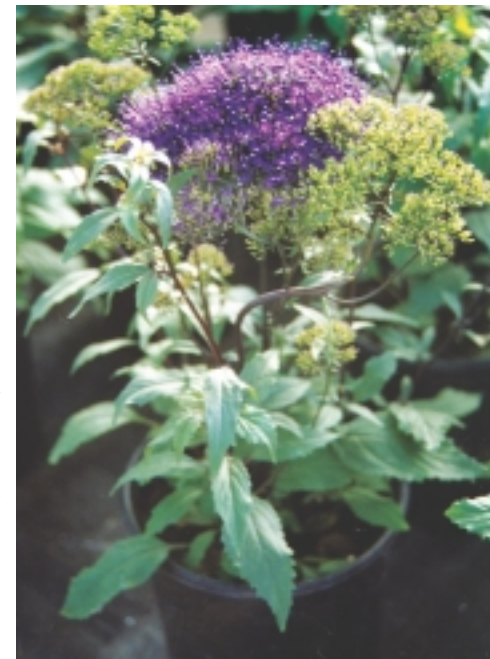
Top to bottom: Salvia 'Sizzler Burgundy Stripe' (Floranova); Bottom: Trachelium 'Jemmy Deep Violet' (Benary).

tainers for mass plantings. Tinkerbelle received a Fleuroselect Quality Mark in 2003.