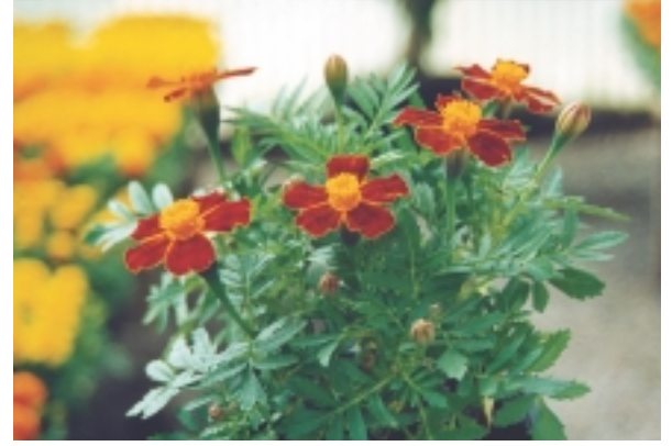
Left: Lobelia 'Aqua White' (American Takii); Right: Marigold 'Disco Red' (Bodger Seed).