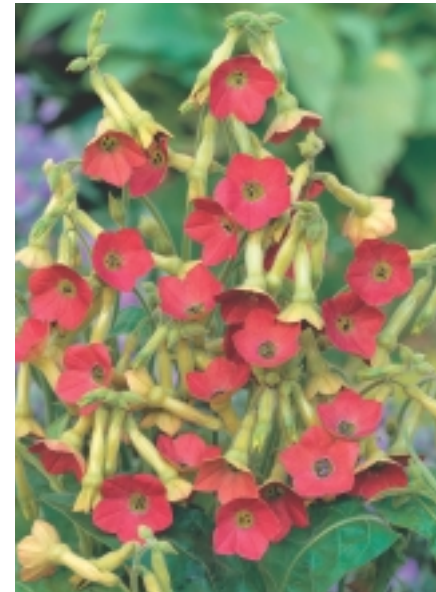
Left: Mimulus 'Magic White Flame' (Floranova); Right: Nicotiana 'Tinkerbelle' (Floranova).