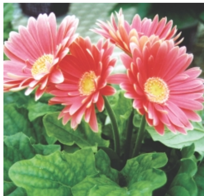
Left to right: Double Dianthus 'Dynasty Red' (PanAmerican); Gerbera 'Jaguar Orange' (S&G Flowers); Gerbera 'Royal Salmon Rose' (The Flower Fields).