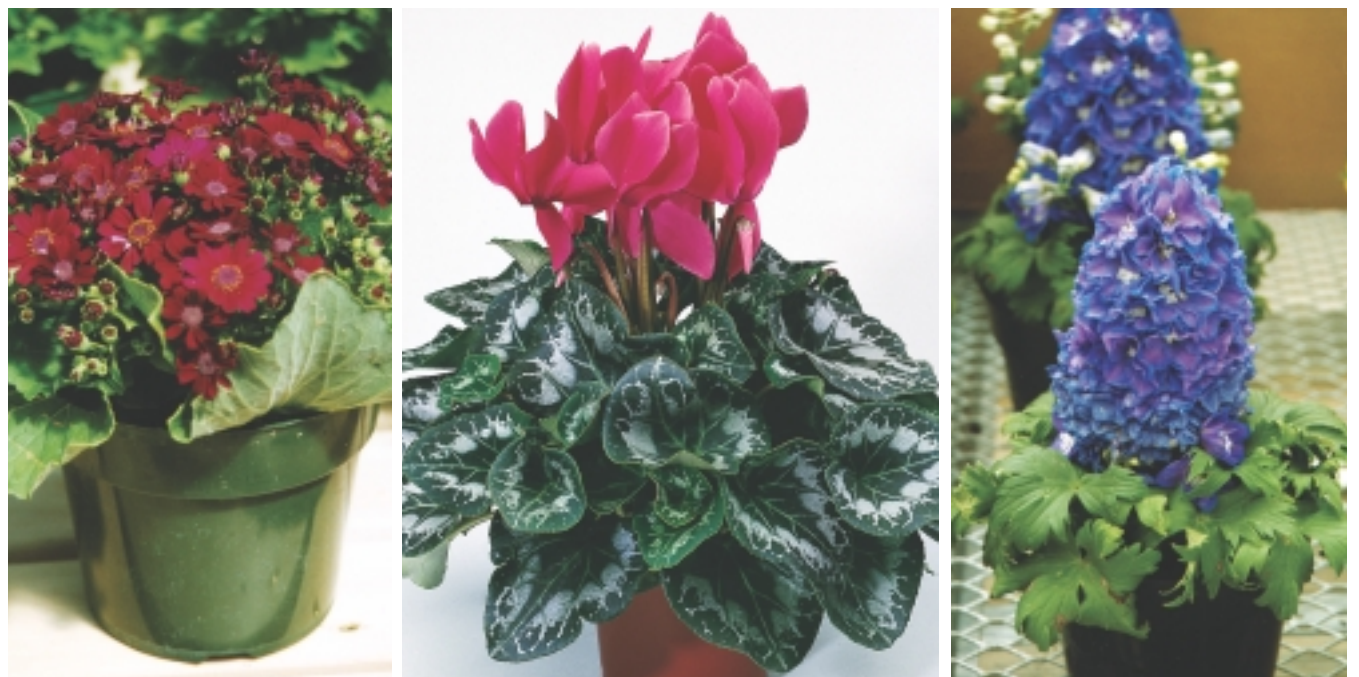
Left to right: Cineraria 'Venezia Bordeaux' (S&G Flowers); Cyclamen 'Robusta Rose' (Goldsmith Seeds); Delphinium 'Guardian Blue' (PanAmerican).

Venezia varieties require no vernalization. Flower stems are short, and the flowers sit on top of the foliage. Eight colors make up the Venezia line: Blue, Blue with Ring, ◆