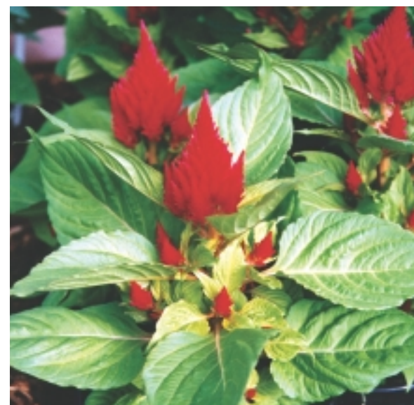
Clockwise from top left: Aquilegia 'Winky Double Red-White' (Kieft Seeds); Calla lily HIPP 'Garnet Glow' (Golden State); Celosia 'Fresh Look Red' (Benary).