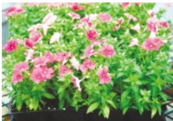
Top: 'Ultima Apricot Shades' (Sakata); Bottom: Phlox 'Ethnie Dark Rose' (Kieft).