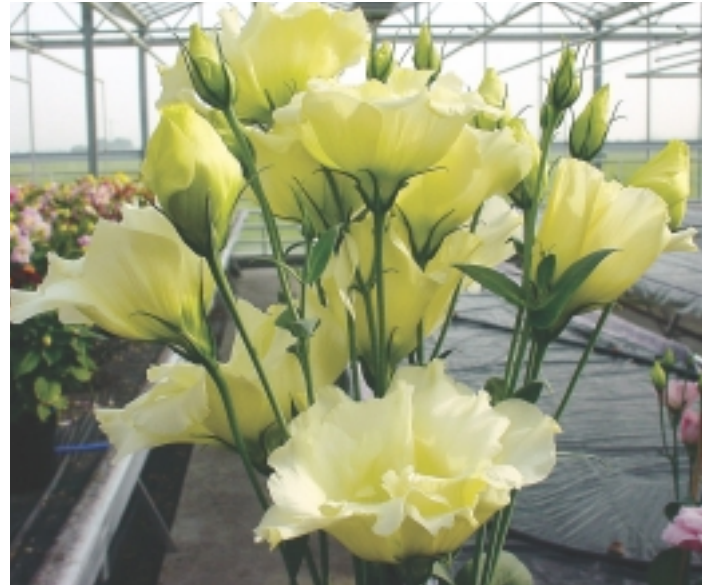
Left: Impatiens 'Jungle Gold' (PanAmerican Seed); Lisianthus 'Cinderella Yellow' (Goldsmith Seeds).